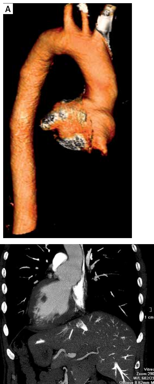
Fig. 1. Preoperative aortic annulus/root aneurysm associated with dilated left main coronary artery visualized by three-dimensional computed tomography (CT) using (A) a volume rendering technique and (B) multiplanar reformation CT, sagittal oblique view

Dextrocardia with situs inversus totalis is a condition in which the heart and other visceral organs are situated on the right side instead of the left in a mirror-like fashion [1]. It is a very rare congenital anomaly affecting approximately 1-2 per 10,000 individuals in the general population [1-2]. Although the heart structure and life expectancy of most patients is normal, some congenital cardiac anomalies can be detected in 3-5% of the subjects. Adult patients with situs inversus are diagnosed incidentally during physical examination or radiological screening conducted for other reasons. The importance of diagnosing this anomaly in adulthood is to prevent errors in medical examinations, interventions, and surgical procedures. Surgery should be carried out from the left side in patients with dextrocardia, and RIMA should be generally selected as the conduit of choice to the LAD [3]. Moreover, in our case, the mitral repair was performed with